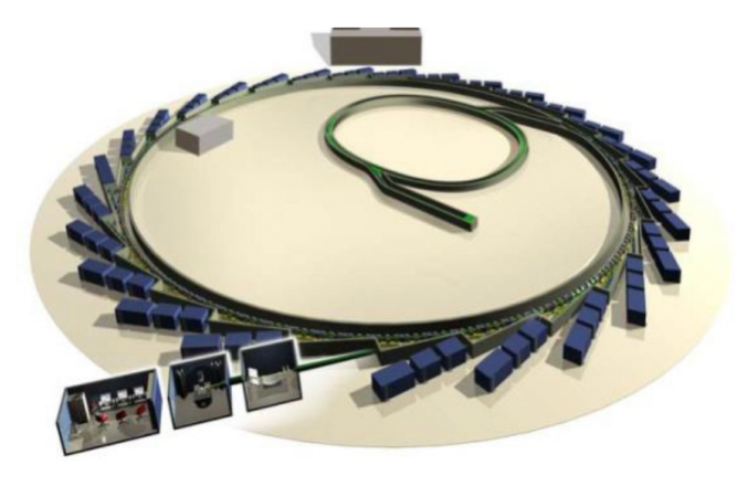
Figure 2. Model of the machine at Diamond Light Source

The second or experimental hutch houses the experimental equipment. Researchers place their sample on a rotating arm, surrounded by detectors, to register the data given by the sample when the beam of light is targeted on it. The final hutch or control cabin is where the scientific team monitors the experiment. Through powerful computers, they can control the alignments, sample position and gather the data obtained by the detectors.